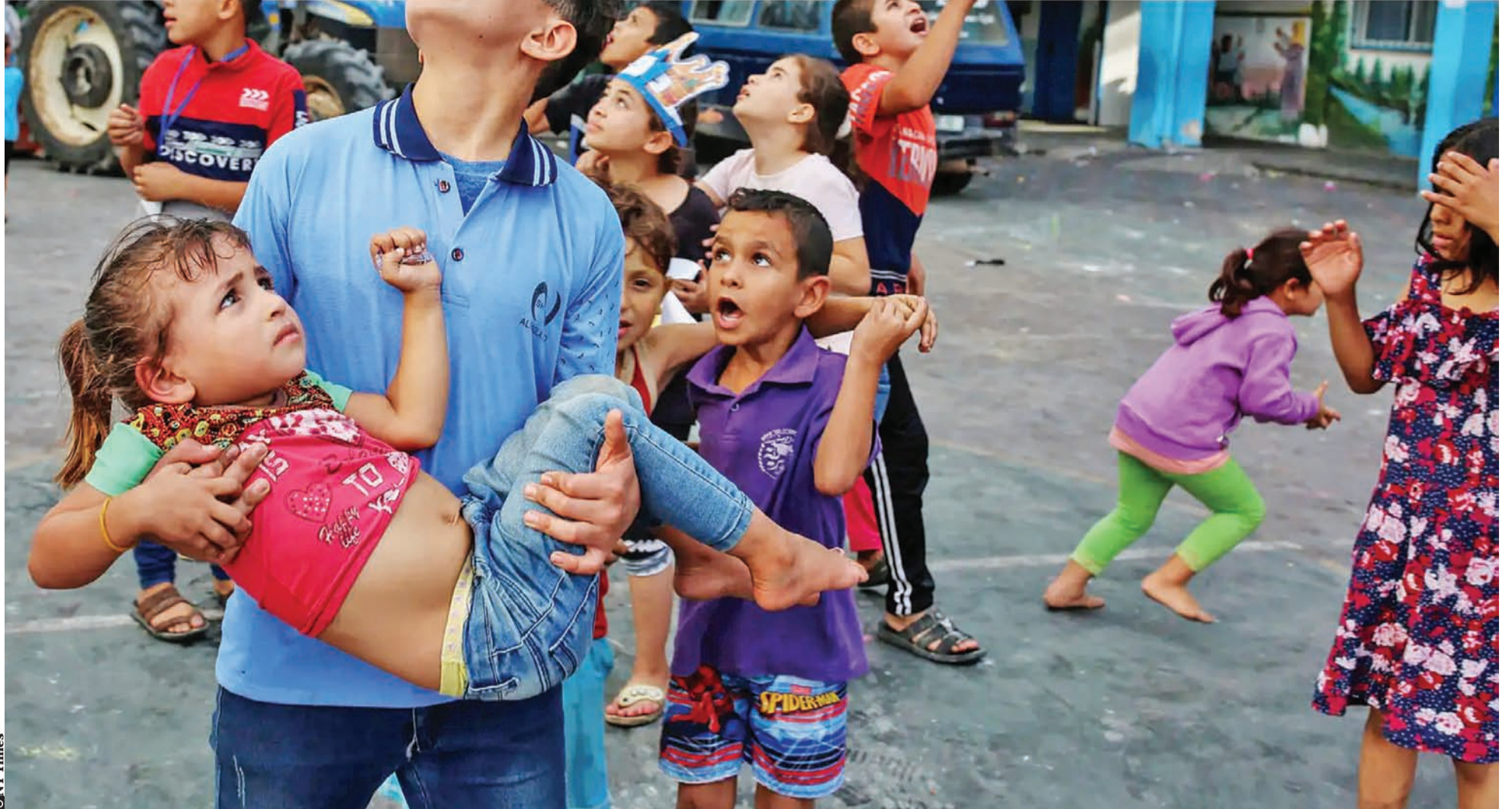
Palestinian children looking toward the sky amid airstrikes at a United Nations-run school in Gaza City on Saturday, October 21, 2023.

Considering the United States' history marred by the tragic displacement and colonization of Native American lands, it is not unreasonable to seek assistance from an animation company like Disney to create heroes for their young generation, to replace the real heroes they have never had the privilege to witness in their own lives. ▶ Page 8