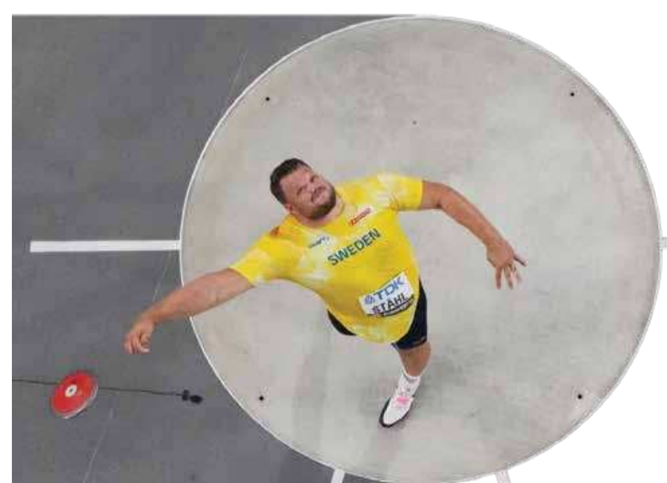
Sweden's Daniel Stahl is in action during the men's discus throw final at the World Athletics Championships in Budapest, Hungary, on August 21, 2023.

Meanwhile, Burkina Faso's Hugues Fabrice Zango soared to victory in the