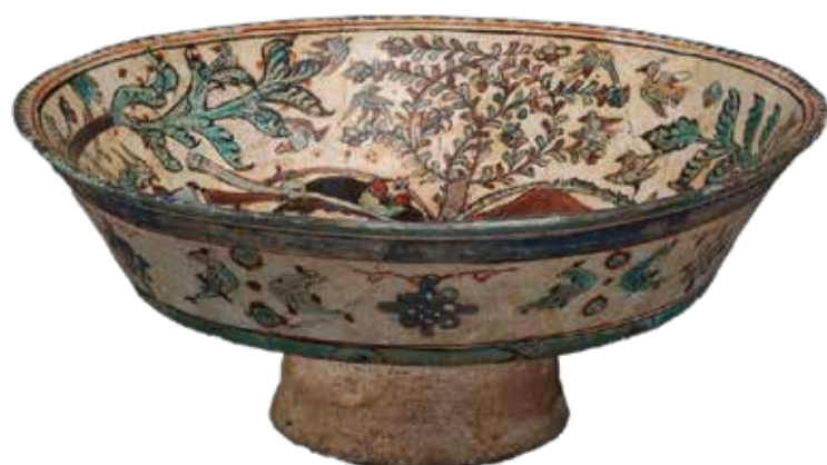
A minai ceramic bowl

Apart from the creation of "miniature" painting, the western art historical canon was also applied for the taxonomy of Persian painting according to the "school." The painting school was often associated with a city or town, rather than the workshop managed by the master, due to the lack of information about named painters or masters in pre-modern Persian painting. This generated a certain bias towards periphery pictorial traditions.