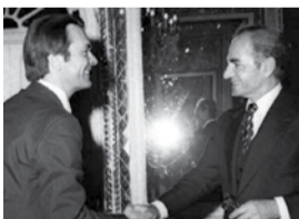
Iran's ousted Shah Mohammad Reza Pahlavi (R) and David Owen

THE GUARDIAN – David Owen, a former British foreign secretary, said the UK should finally acknowledge its leading role in the 1953 coup that toppled the democratically-elected government of Iranian Prime Minister Mohammad Mosaddeq. The US formally admitted its role 10 years ago with the declassification of a large volume of intelligence documents, which made clear that the ousting of Mosaddeq 70 years ago this week was a joint CIA-MI6 endeavour.