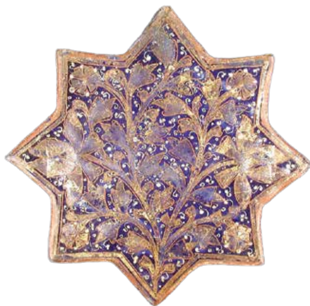
A lajvardina star-shaped tile