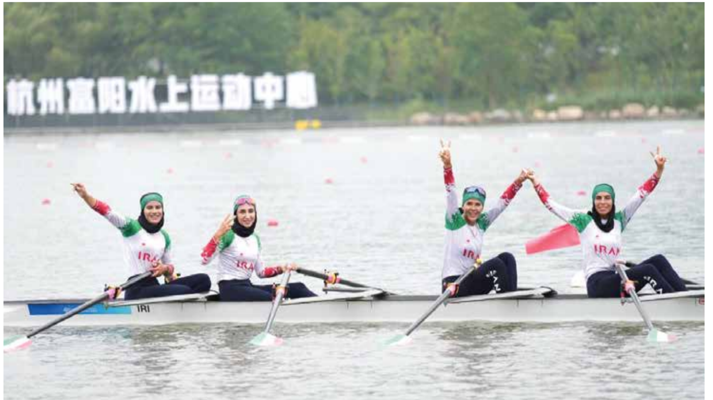
The Iranian team celebrates after winning the women's quadruple sculls silver at the Asian Games in Hangzhou, China, on September 25, 2023.