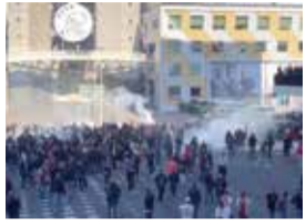
Police officers use teargas to disperse football fans rioting Johan Cruyff Arena in Amsterdam, Netherlands, on September 24, 2023.