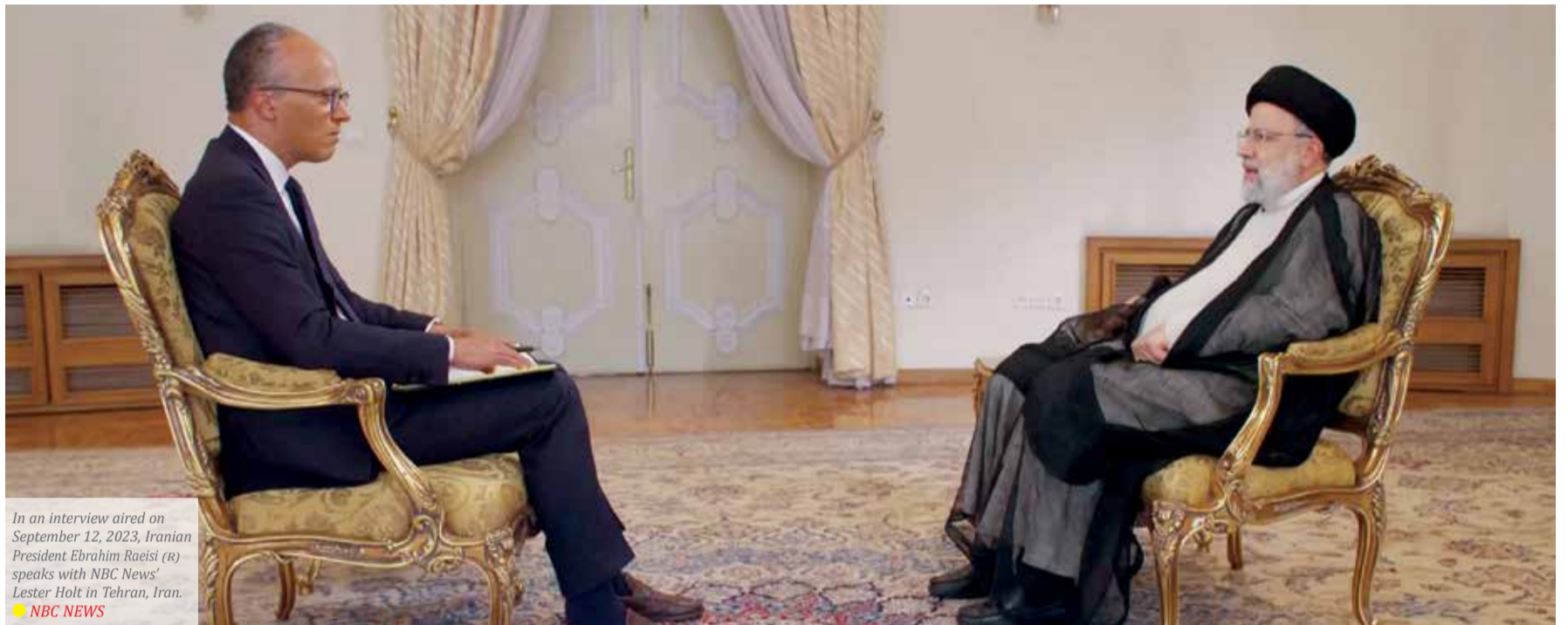
In an interview aired on September 12, 2023, Iranian President Ebrahim Raeisi (R) speaks with NBC News' Lester Holt in Tehran, Iran.