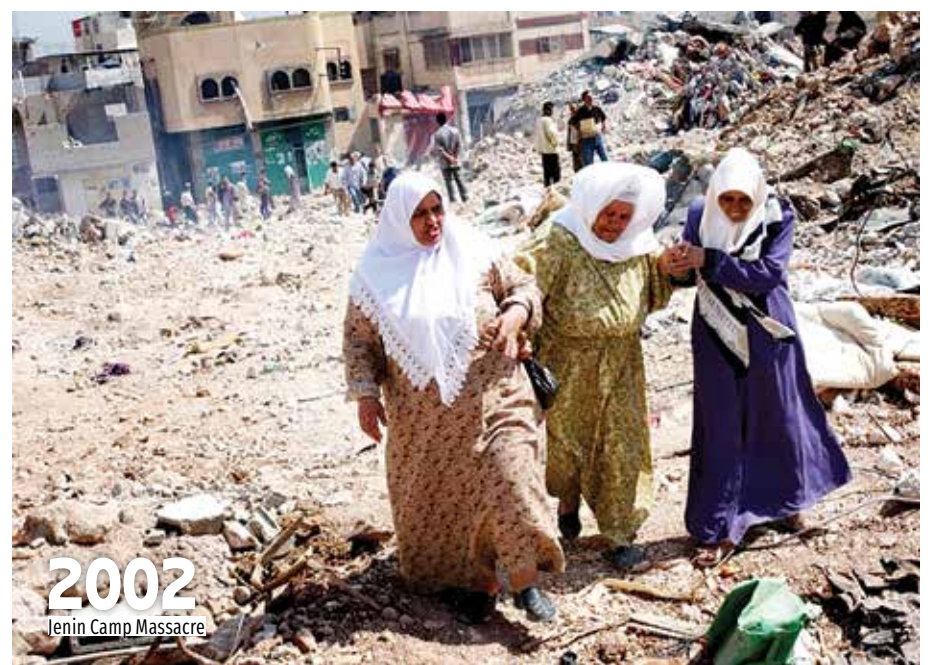
2002 Jenin Camp Massacre

This massacre occurred on April 18, 1996 when Israeli occupying forces deliberately targeted the UN-affiliated compound after 800 Lebanese and Palestinian civilians had taken refuge there, fleeing from Israeli attacks in the region. Out of them, 110 were killed, including women and children.