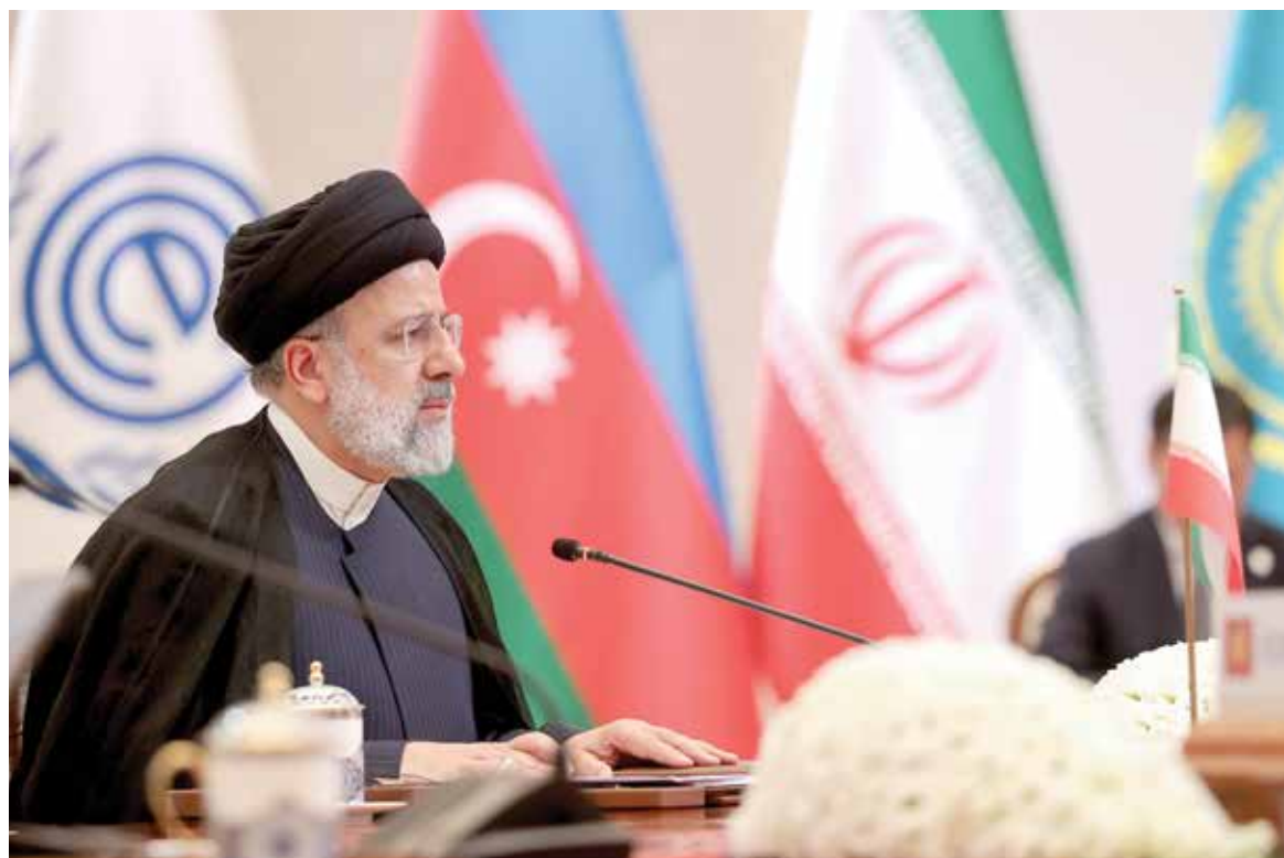
Iranian President Ebrahim Raisi speaks at the 16th Economic Cooperation Organization (ECO) Summit in Tashkent, Uzbekistan on November 9, 2023.