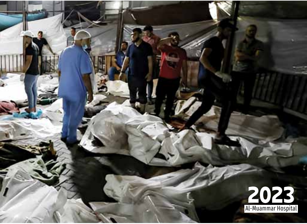
2023 Al-Muammar Hospital