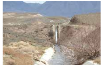
Baladeh Qanat, Ferdows