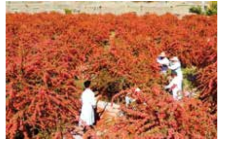
A barberry farm in South Khorasan Province ● apochi.com