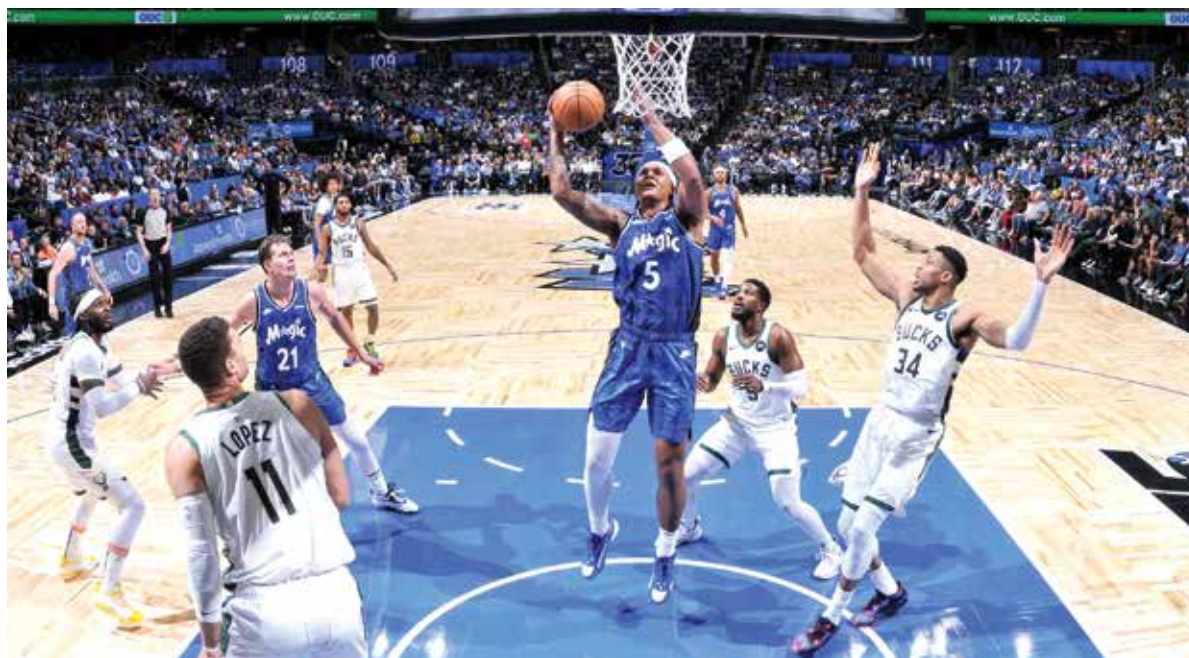
Magic's Paolo Banchero (5) goes up for a basket during an NBA victory over the Bucks at Amway Center, Orlando, FL, US, on Nov. 11, 2023.

Donovan Mitchell (21 points), Darius Garland (19) and Evan Mobley (19) led all five starters in double figures for the Cavaliers, who had lost 12 straight regular-season games to the Warriors before a 115-104 home win last Sunday. The sweep was Cleveland's first over Golden State since 2010. Stephen Curry led all scorers with 30 points but shot just 4-for-14 on