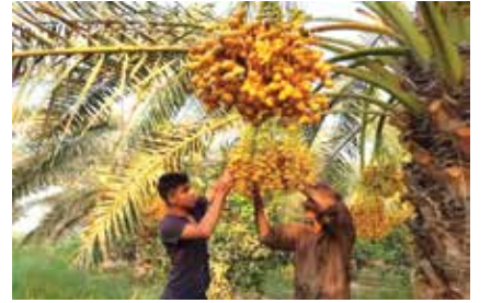
Date harvest festival of Tabas