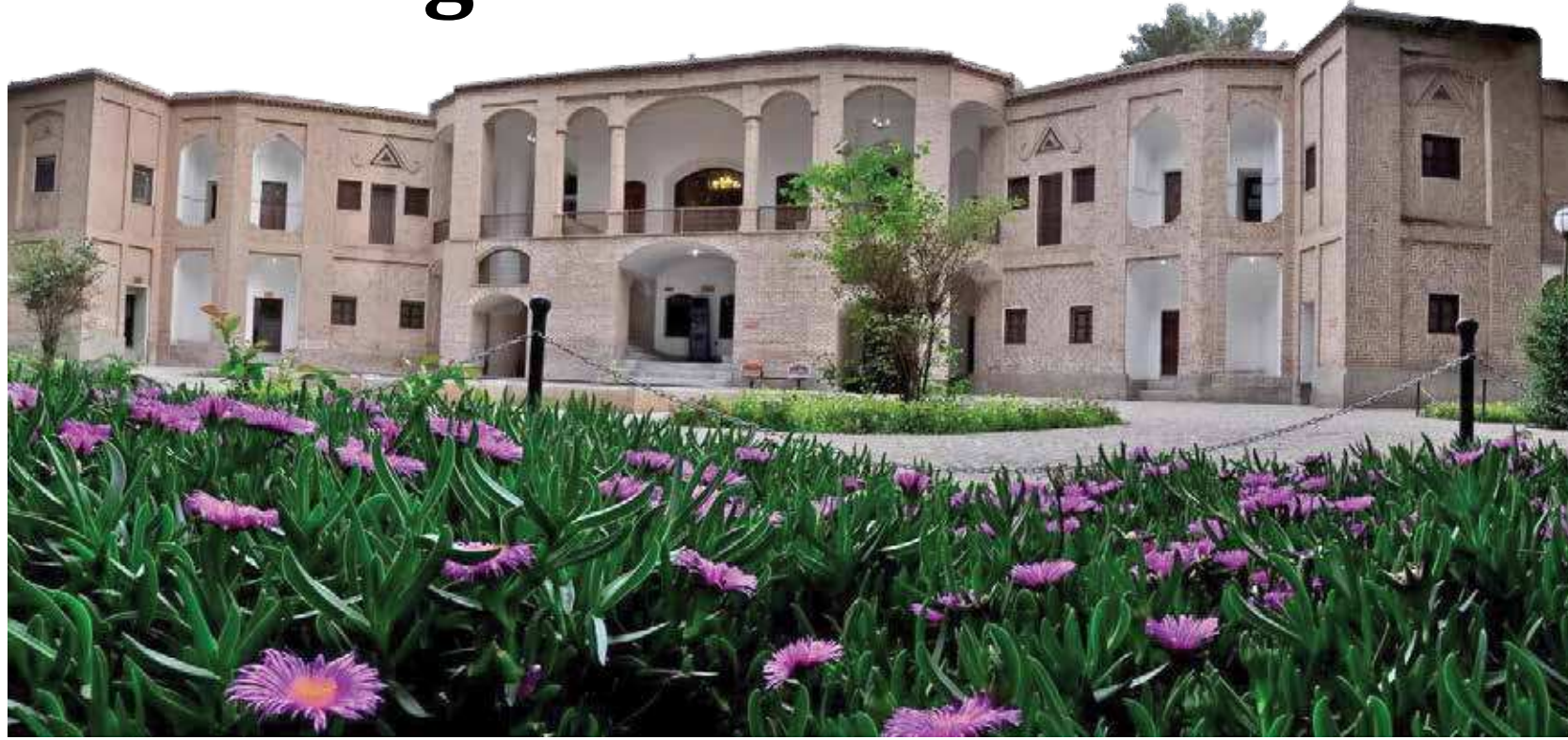
Akbarieh Garden, Birjand ● ealiya.com