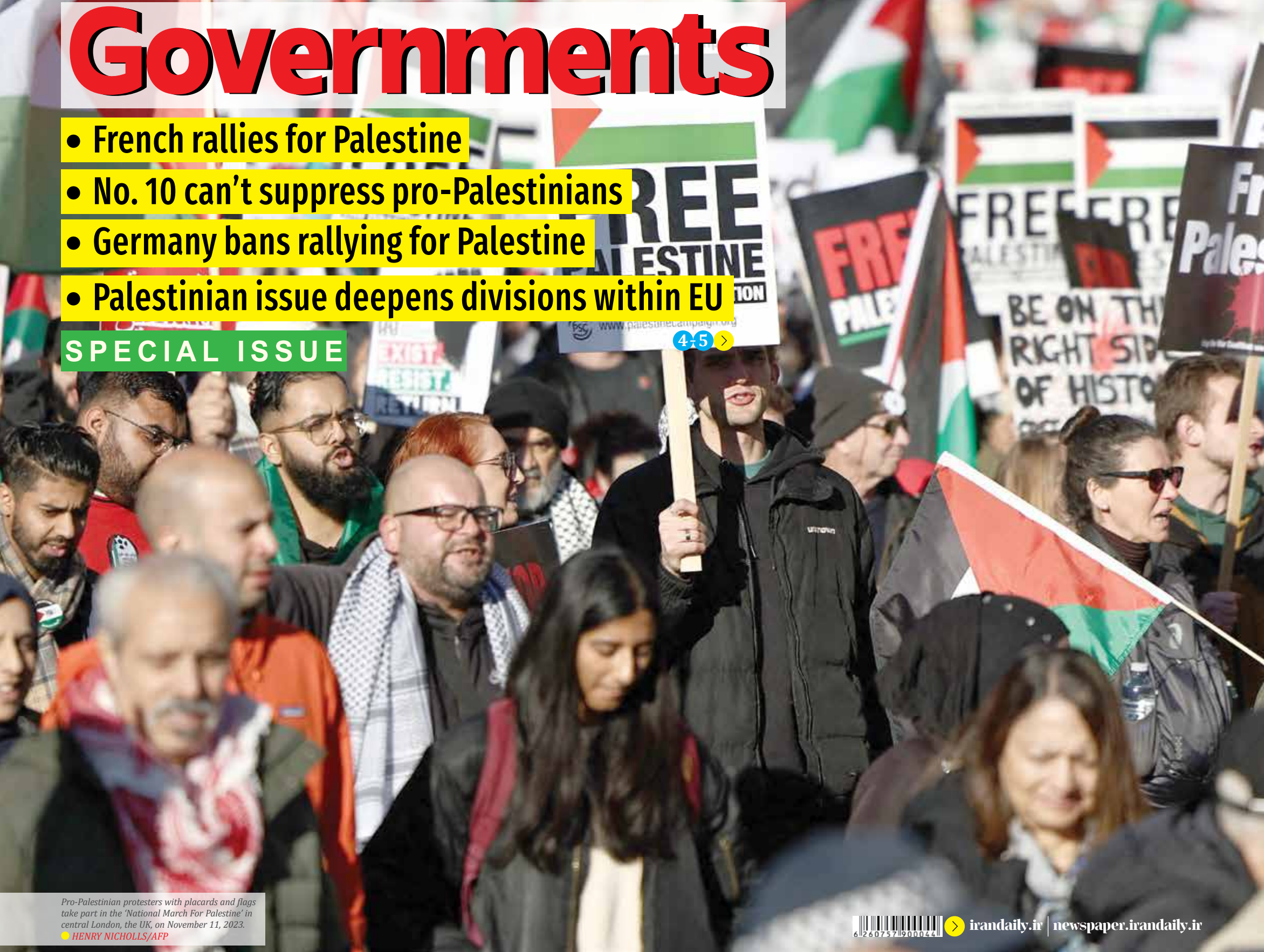
Pro-Palestinian protesters with placards and flags take part in the 'National March For Palestine' in central London, the UK, on November 11, 2023.

Vol. 7433 • Monday, November 13, 2023 • Aban 22, 1402 • Rabi' al-Thani 28, 1445 • Price 40,000 Rials • 8 Pages