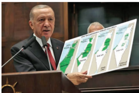
Why Can't Turkey draw a line?

Also, Israelis continue to gobble up food that's made from agricultural produce imported from Turkey. No Turkish official has yet signaled that shipments to Israel would be stopped, or at least limited, in response to its mass slaughter of Palestinians in the besieged Gaza Strip.