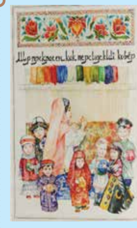
A school at the Embassy of the Russian Federation in the Islamic Republic of Iran

The beauty of our planet is in its diversity and every nation and every person fills it with new colors. Just like how every thread and knot in a Persian carpet contributes to a unique pattern, the multitude of cultures, traditions and people of the country symbolize the vibrant tapestry of our world. The artwork serves as a reminder that in the face of wars and conflicts, we have a shared responsibility to protect and preserve humankind and the beauty of our planet.