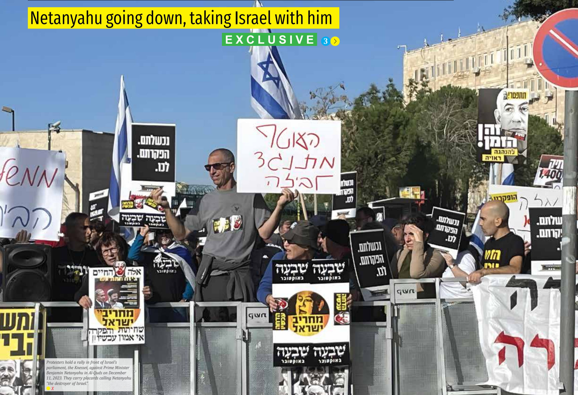
Protesters hold a rally in front of Israel's parliament, the Knesset, against Prime Minister Benjamin Netanyahu in Al-Quds on December 11, 2023. They carry placards calling Netanyahu "the destroyer of Israel."