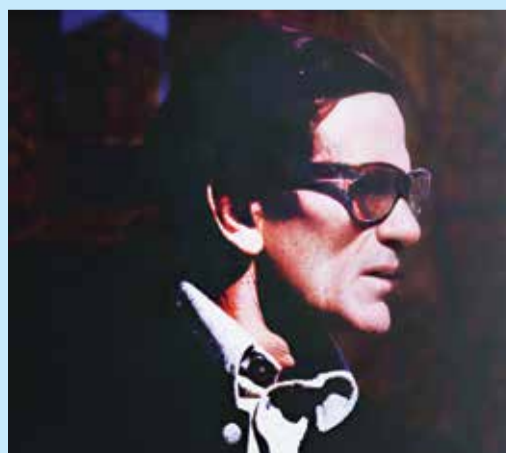
'Portrait of Pier Paolo Pasolini,' at Jaame' (Grand) Mosque, Isfahan, Iran; digital image of the original 1973 painting

This photo was taken by Roberto Villa, on the set in Isfahan, of Pier Paolo Pasolini's movie 'The Flower of the One Thousand and One Nights'. It wisely captures the essence of the Italian intellectual's attachment to Iran, a country he considered extremely attractive in its artistic and monumental heritage, rich in history, and genuinely hospitable to its guests. Part of an exhibit that the Italian Embassy in Tehran organized together with the Pejman Foundation in Tehran at Argo Factory in 2022, this portrait's background is a testimony to the values of cultural exchanges between Italy and Iran.