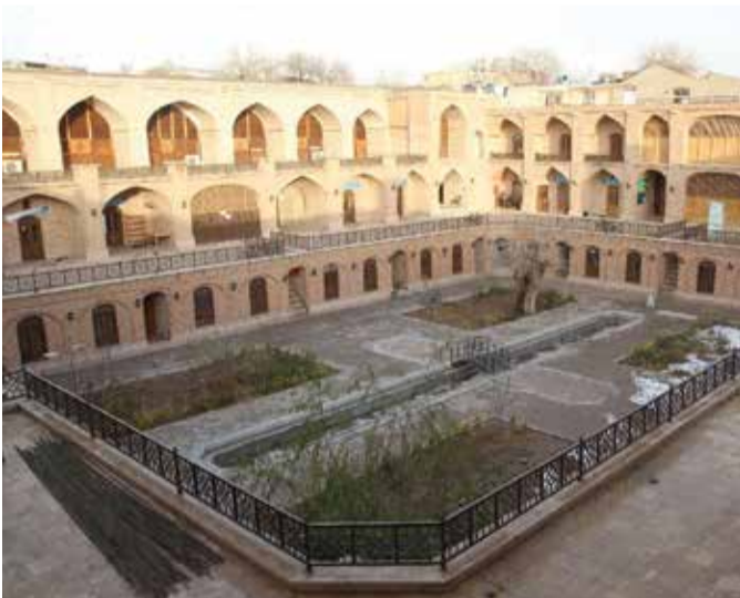
↑ Salehieh School