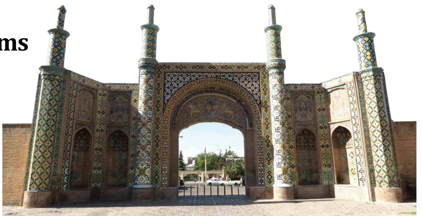
↑ Darb-e Koushk Gate

house with a shahneshin (a large room decorated with colorful glasses, delicate mirror works, and beautiful tiling), a korsi khaneh (a room housing a traditional low table with a heater underneath it), and a small pool in its basement. In the middle of its courtyard, there is a turquoise pool adorned with flower vases, and around the courtyard you can see cherry trees.