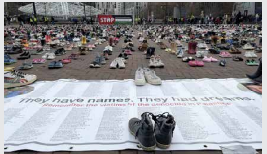
8,000 pairs of shoes are placed in Rotterdam, the Netherlands, on December 20, 2023 to highlight the Palestinian children killed in Gaza since October 7, 2023.