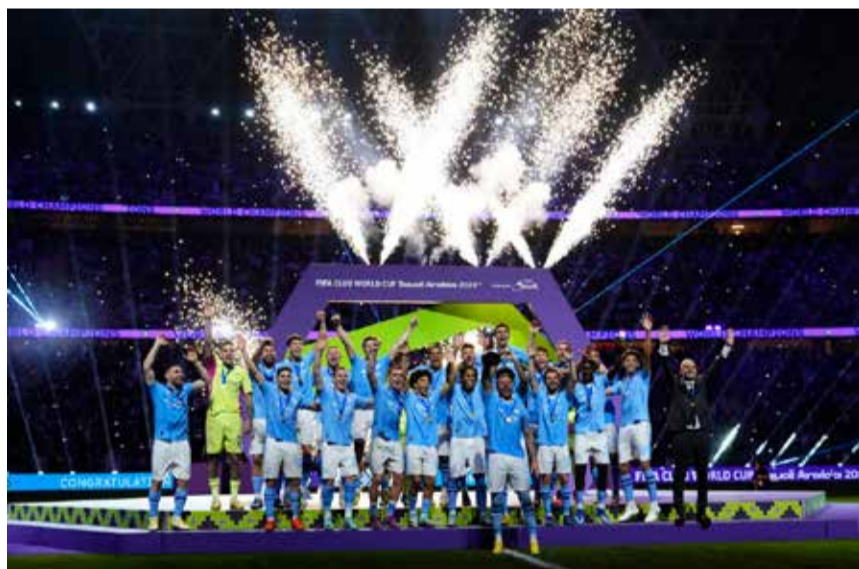
Kyle Walker holds aloft the Club World Cup trophy as Manchester City players and manager Pep Guardiola celebrate winning the final against Fluminense at the King Abdullah International Stadium, Jeddah, Saudi Arabia, on Dec. 22, 2023.