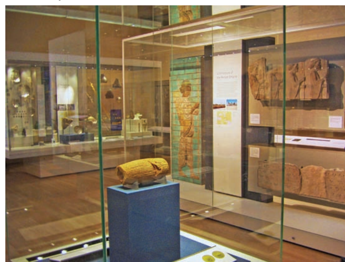
The Cyrus Cylinder in Room 52 of the British Museum in London

The Cyrus Cylinder, which bears cuneiform script in the name of the Persian king Cyrus the Great, traces its origins to the ancient