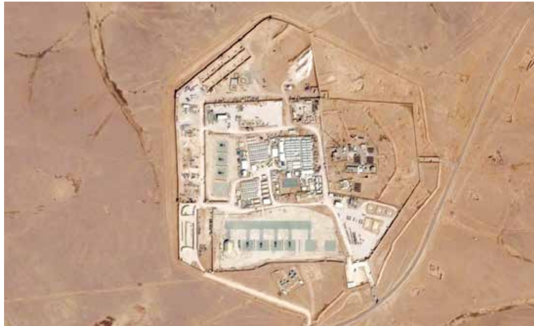
The photo shows a satellite view of the US military outpost known as Tower 22, in Rukban, Rwaished District, Jordan, on October 12, 2023.

"We are concerned and would urge Iran to continue to de-escalate