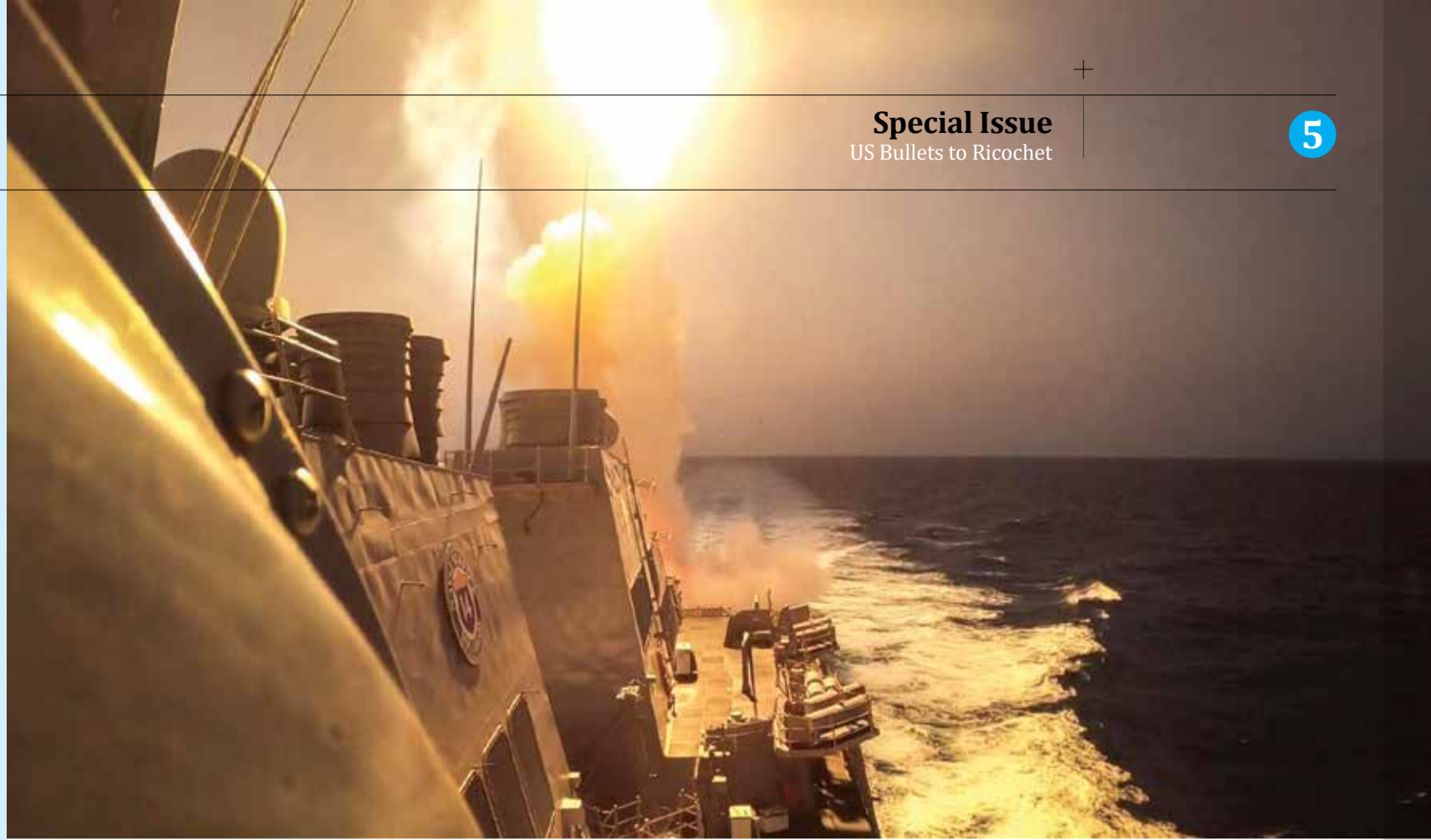
USS Carney firing interceptors at missiles and drones launched from Yemen over the Red Sea on October 19, 2023. ● US ARMY