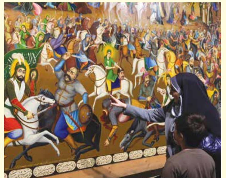
The 16th Fajr Visual Arts Festival opens in the Tehran Museum of Contemporary Art on January 28, 2024.