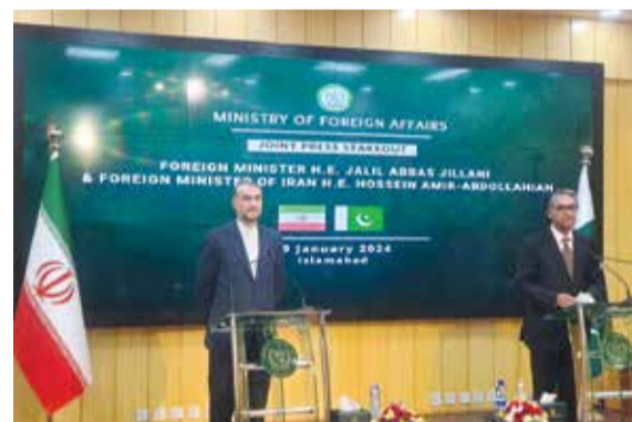
Iranian Foreign Minister Hossein Amir-Abdollahian (L) and his Pakistani counterpart Jalil Abbas Jilani speak at a joint press conference in Islamabad, Pakistan, on January 29, 2024.

Pointing to the constructive cooperation between