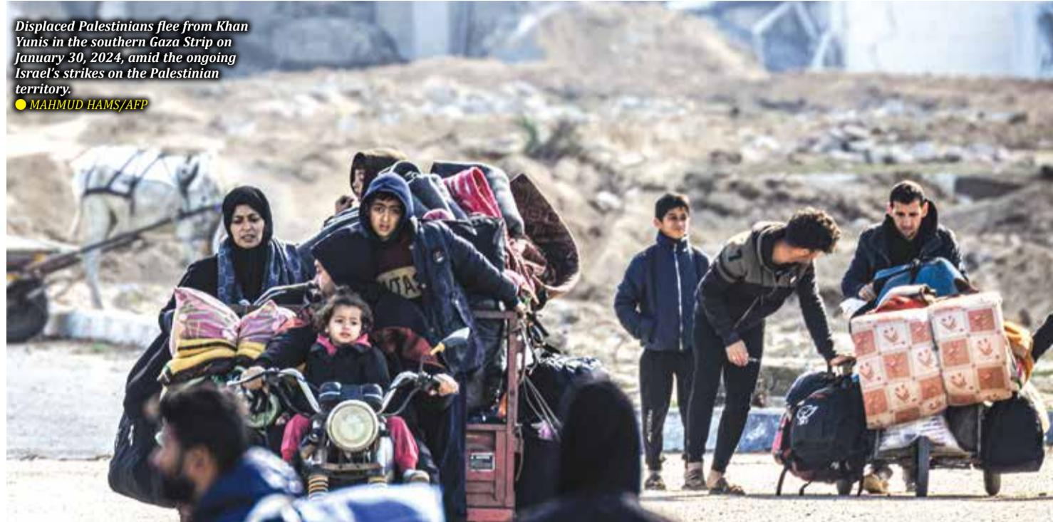
Displaced Palestinians flee from Khan Yunis in the southern Gaza Strip on January 30, 2024, amid the ongoing Israel's strikes on the Palestinian territory.