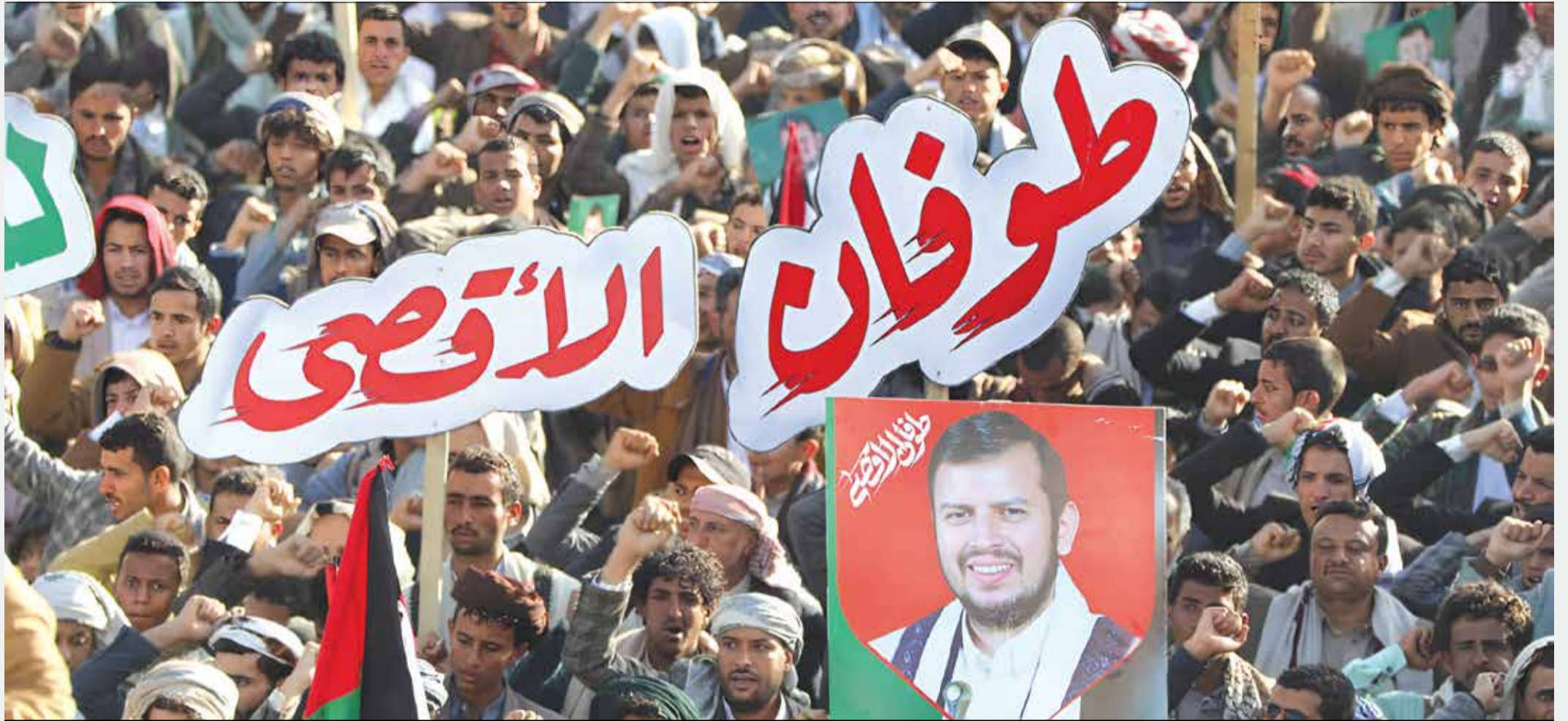
A rally in Sanaa, Yemen, in 2023

Vol. 7499 ● Thursday, February 1, 2024 ● 100,000 rials ● 8 pages