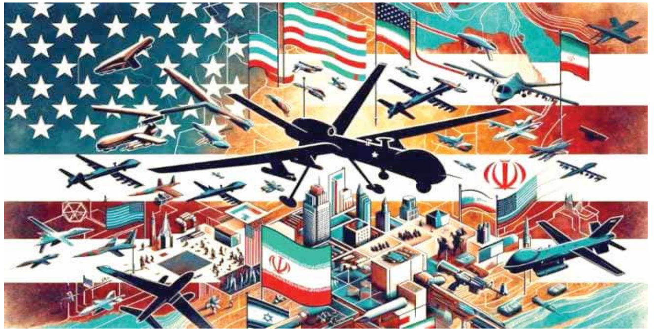
The illustration depicts the complex situation before Iran, the US, Israel, and other regional players after a drone strike by an Iranian-backed Iraqi group hit a US base in northeastern Jordan, killing three soldiers and injuring more than 40 others.