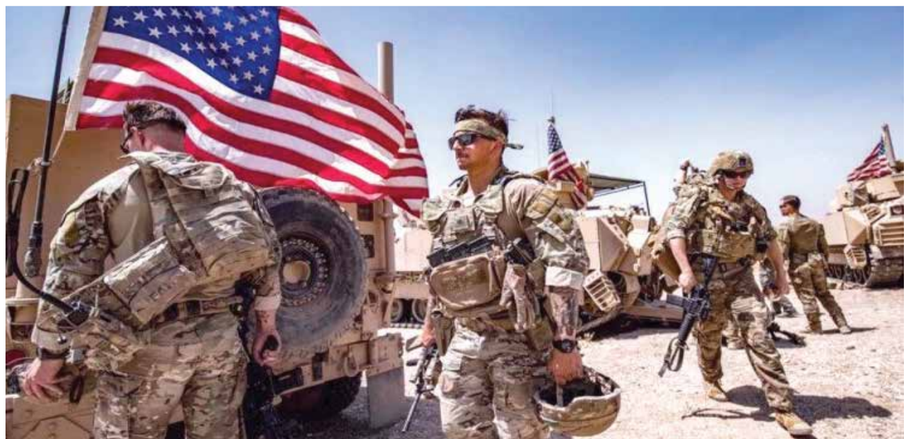
US soldiers patrol the countryside of the oil-rich town of Rumeilan in Hasakah province, northeastern Syria, on June 7, 2023.