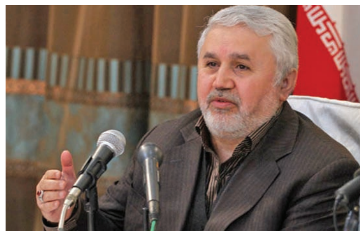
Ali Darabi, the deputy minister of cultural heritage and tourism, speaks in an undated photo.

Emphasizing the shared identity and historical depth between the two nations, the official stressed the duty to preserve the