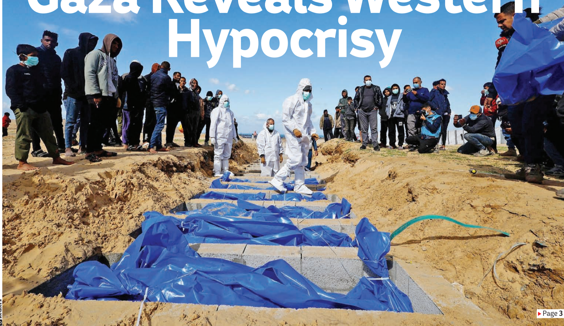
The bodies of Palestinians killed during the war are buried in a mass grave on January 30, in Rafah, Gaza.